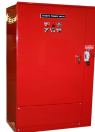
Fire Pump Transfer Switch