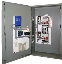
Molded Case Transfer Switch