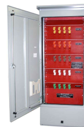
Quick Connect Cabinet