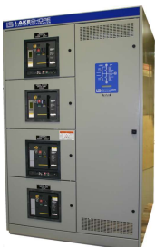
UL 891 Switchboard